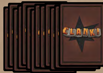
40 Dungeon Deck cards