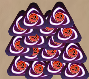
24 Curse tokens