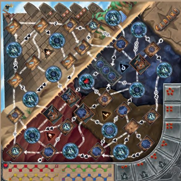
Double-sided Game Board