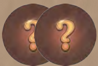
2 Major Secrets