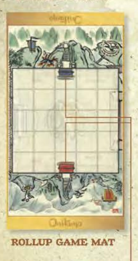
TEMPLE ARCH SQUARES