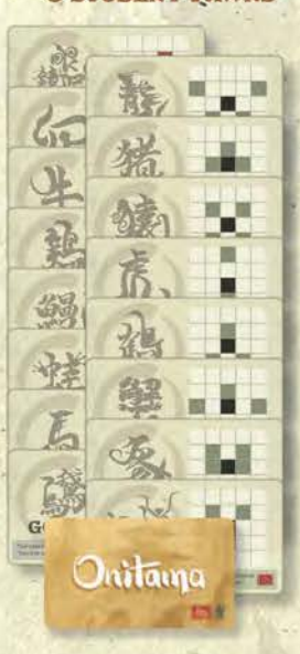
16 MOVE CARDS